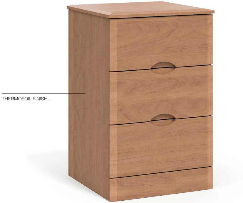
THERMOFOIL FINISH -

NOTE: Upholstery and/or additional options must be specified separately.